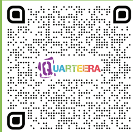
Counseling on asylum and residence

Please note: We can only guarantee a consultation with an appointment.